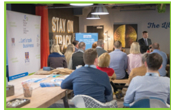
Sales Seminar, held in conjunction with TTM Healthcare (8th May)

✓ 433 students from 15 schools took part in the Student Enterprise County Final