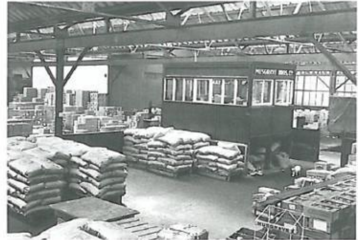
Interior of Cornmarket Street wholesale warehouse