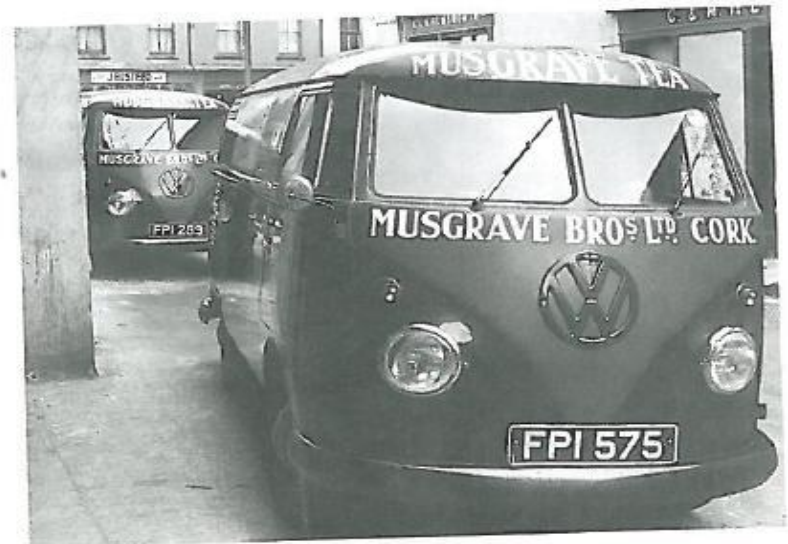
Musgrave Tea vans