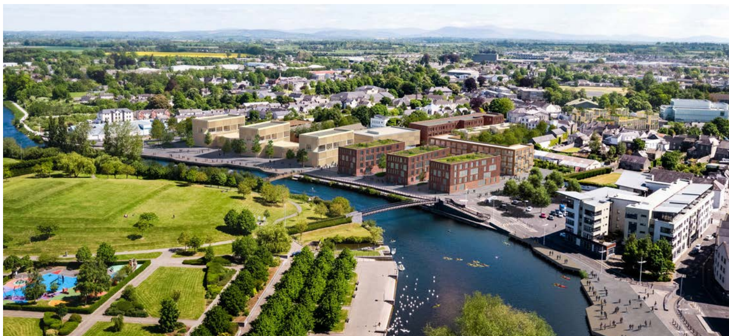
Project Carlow 2040

For further information, visit projectcarlow2040.com