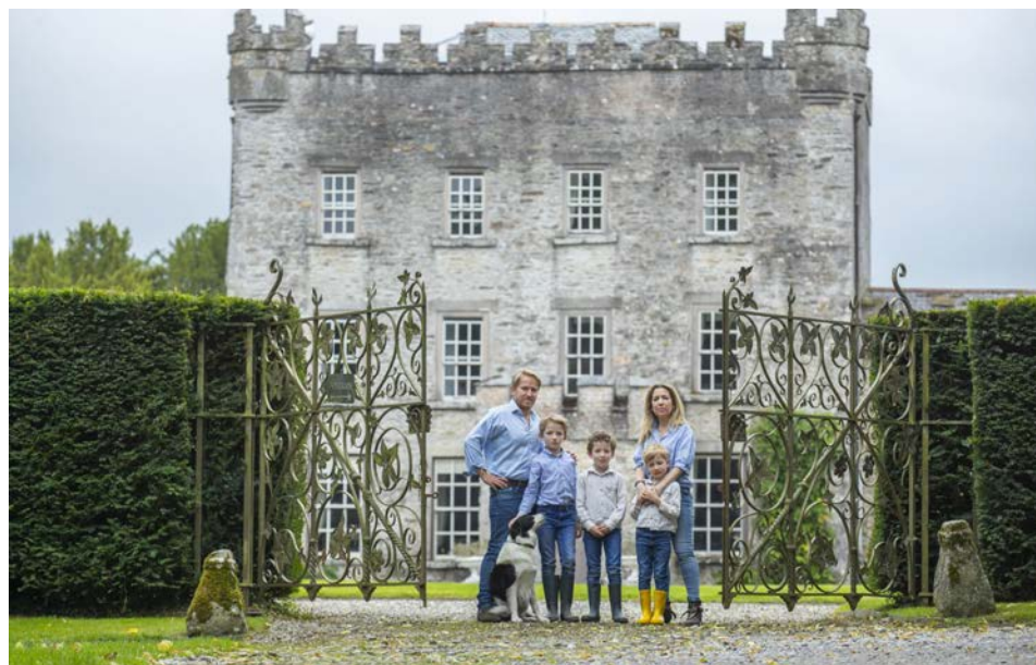
Huntington Castle and Gardens