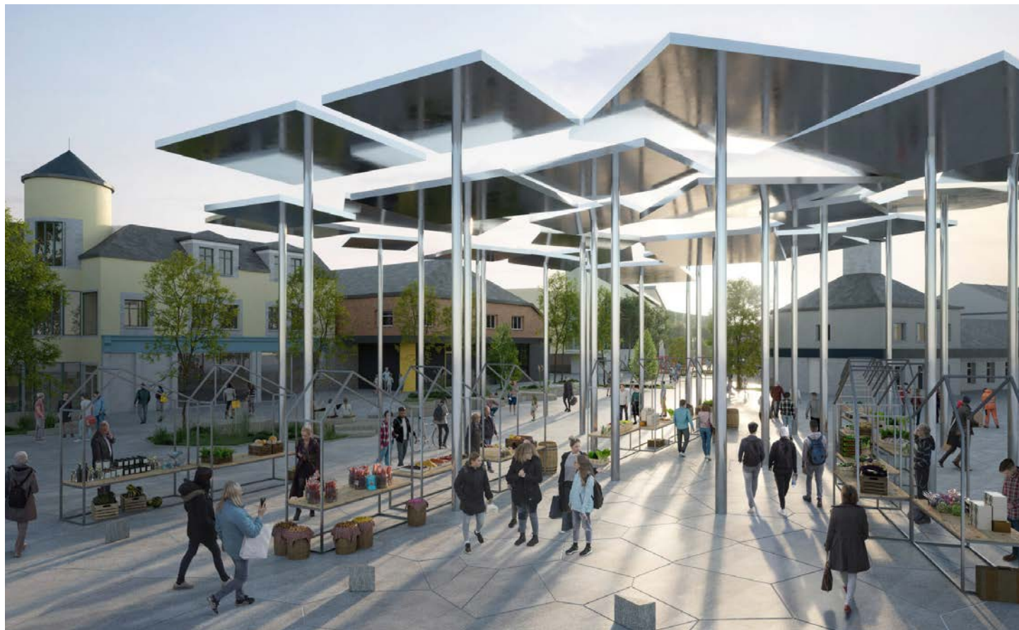
Vision for Potato Market, Carlow