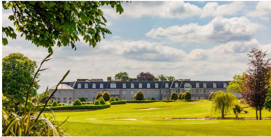
Mount Wolseley Hotel, Spa and Golf Resort