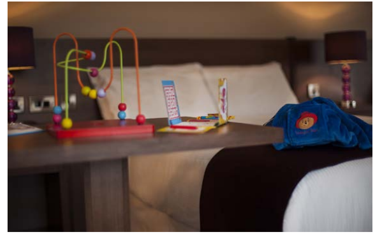
Woodford Dolmen Hotel