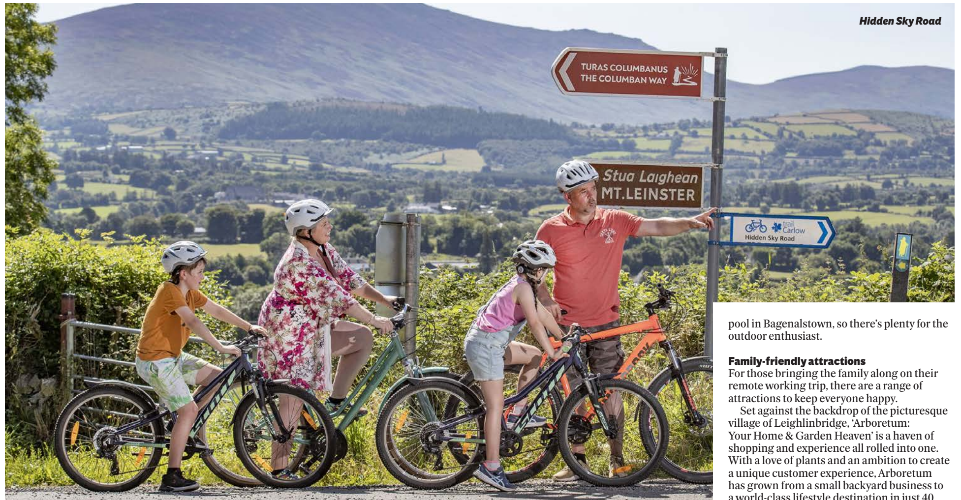
Hidden Sky Road