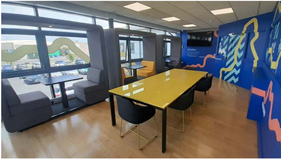
Founders Room – Connected Hub, O'Brien Road, Carlow