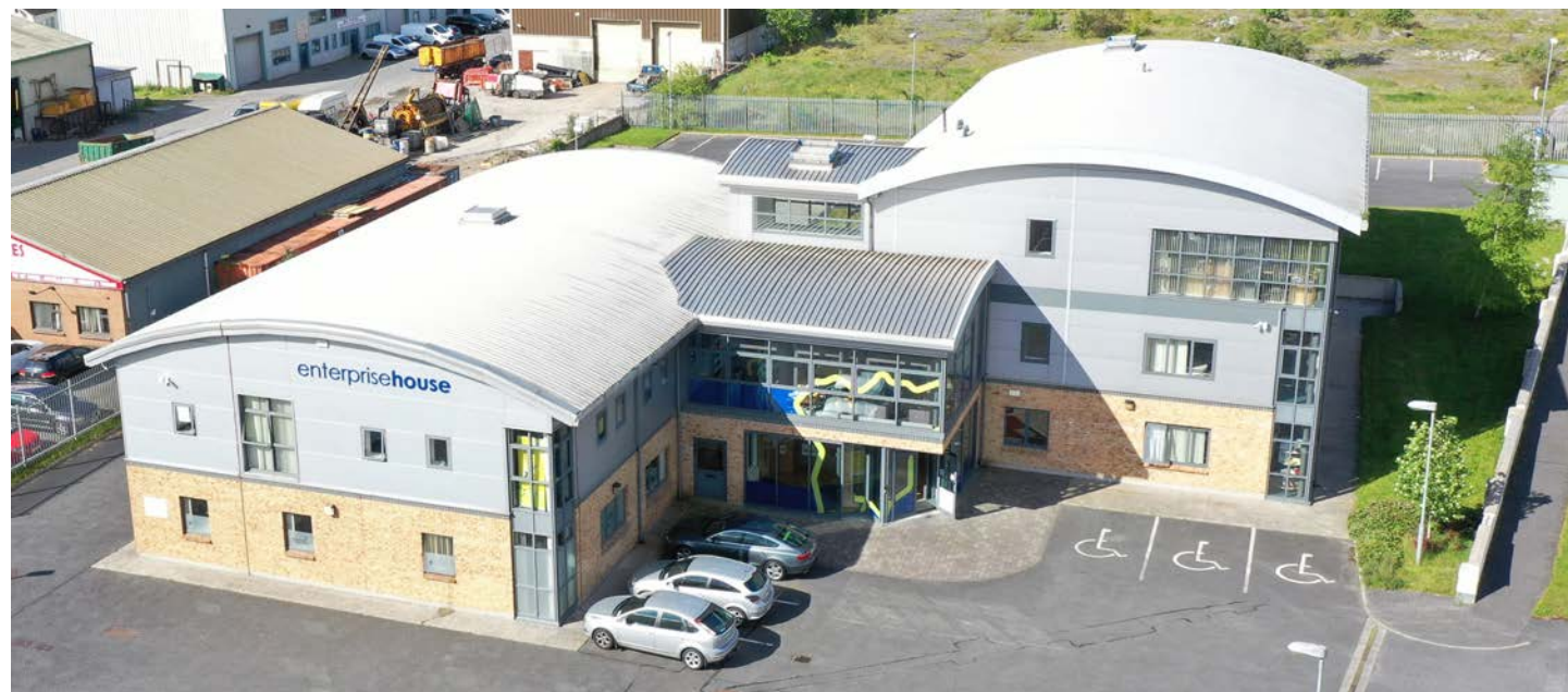
Enterprise House, O’Brien Road, Carlow – part of the Connected Hub Network

For more information on Aon Ireland, visit aon.com/ireland