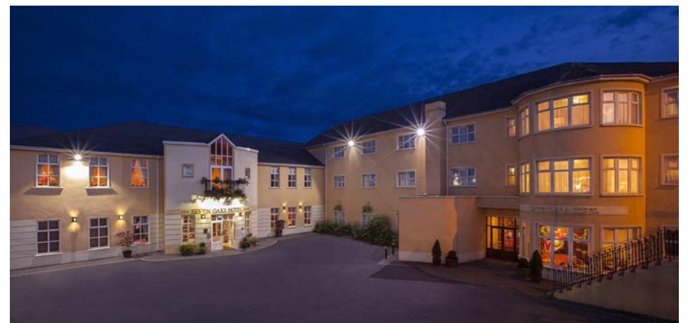
Seven Oaks Hotel