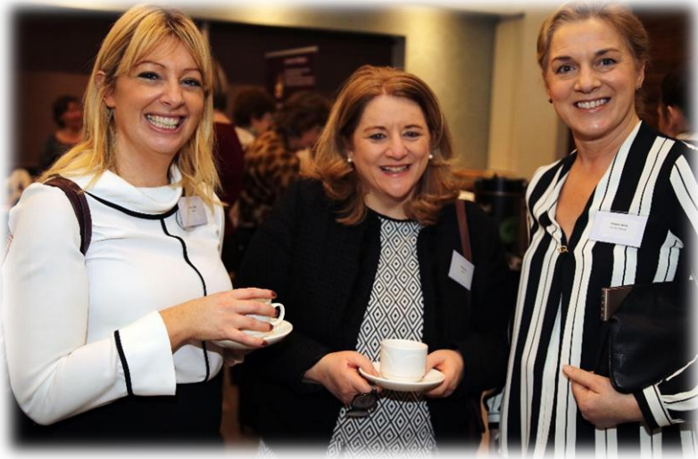
A fun night was had by all at our new venue Hotel Kilmore