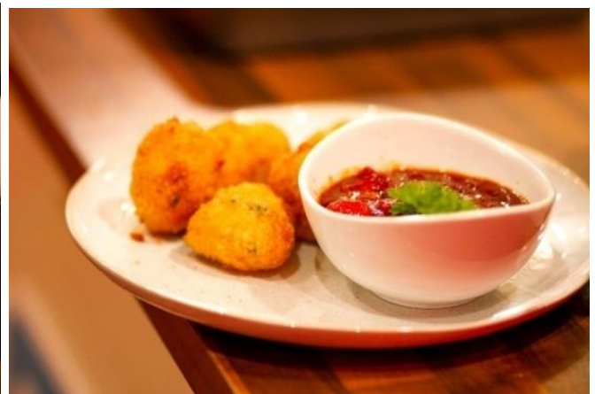
Stuffing & Cranberry Parcels