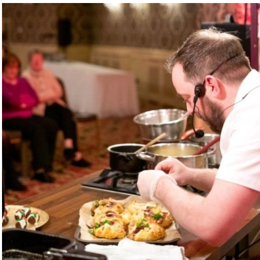
Goats Cheese Arancini with Tomatoe dipping sauce