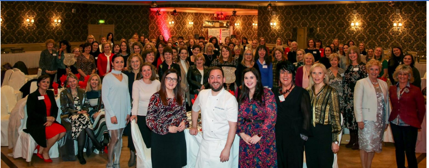
A packed house at the Cavan Business Women's Club final event of 2019