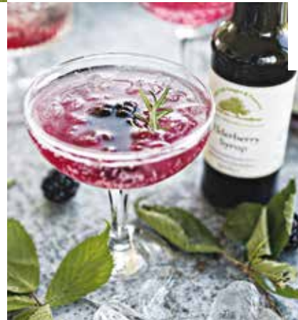
Syrup produced by Wild Irish Foragers, a small, family-run business in Offaly