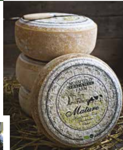
Mossfield Cheese is one of a number of produced at Mossfield Organic Farm

Great strides are also being made in celebrating and promoting filmmaking in the county. Taking place across Birr town in October, OFFline is a film festival dedicated to making and screening quality films in the Irish midlands. Last year's winner went on to win an Oscar for his film, Stutterer .