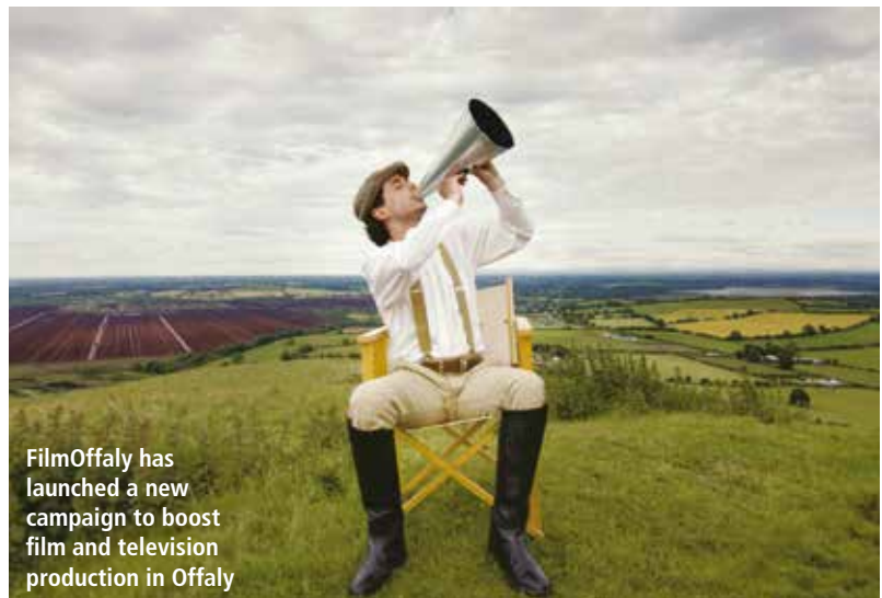
FilmOffaly has launched a new campaign to boost film and television production in Offaly

Businesses in Offaly are supported by Offaly County Council, through the Local Enterprise Office (LEO). The Local Enterprise Office is the 'one stop shop' for all Government supports for anyone looking to set up or expand their business and create jobs in Offaly. The LEO has a close working relationship with other development agencies, private sector and Chambers