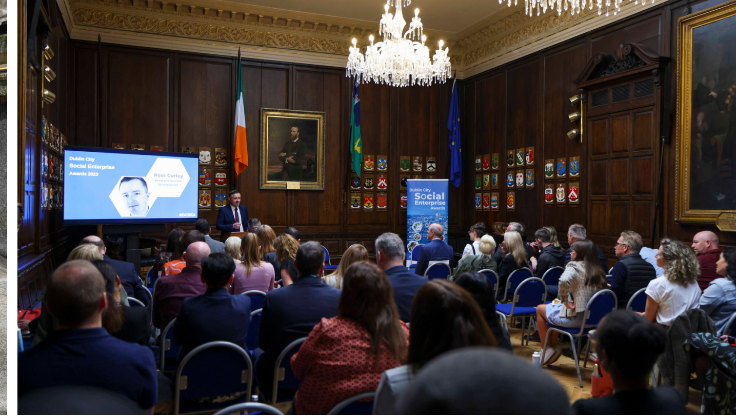
Social Enterprise Committee addressing the room