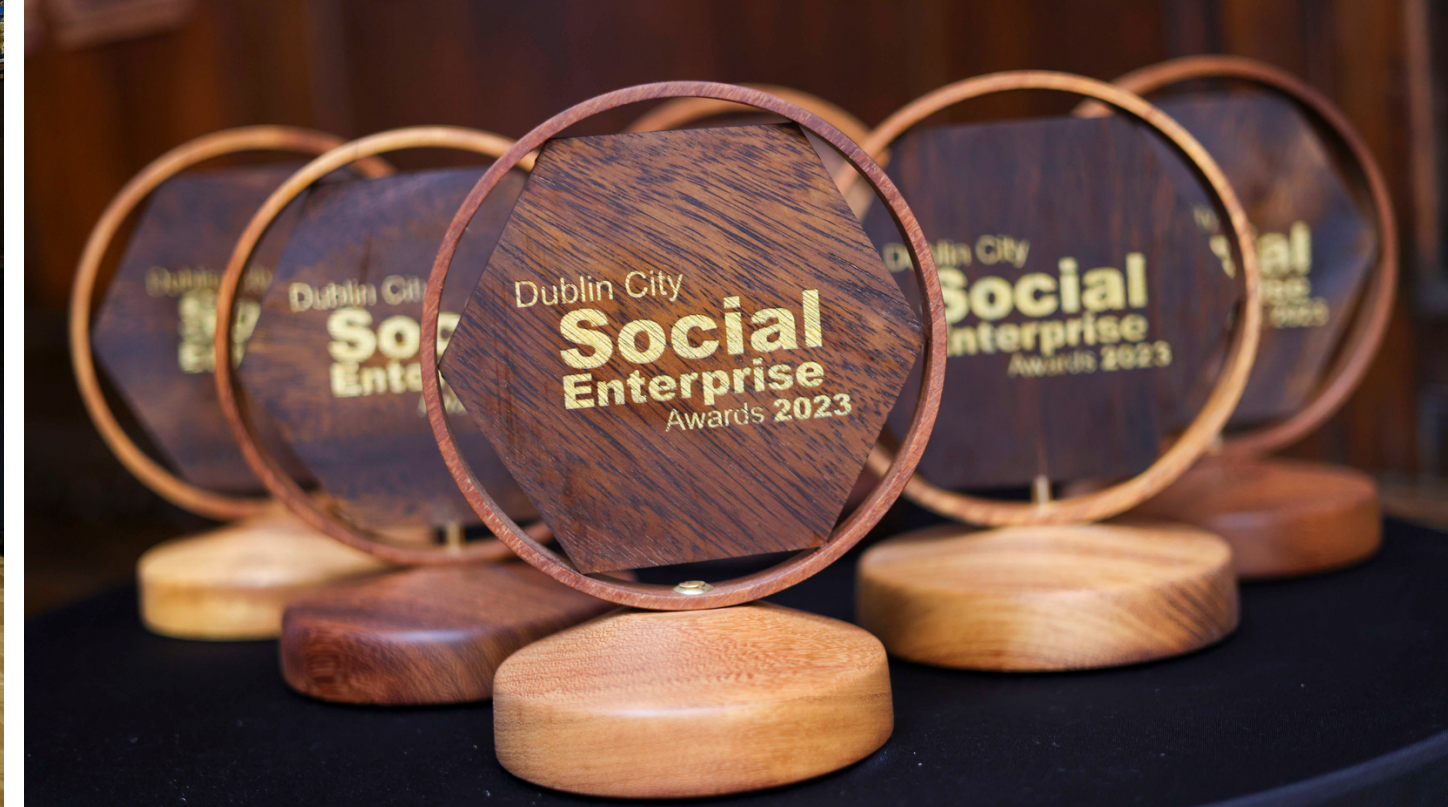
Bespoke Trophies created by The Yard Crew from Solas Project