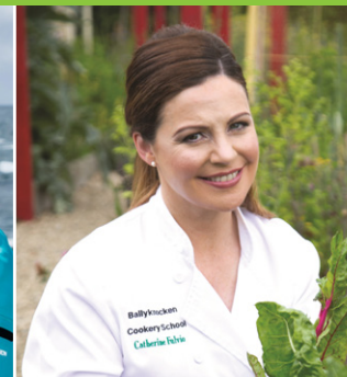
Catherine Fulvio TV chef, food writer & author