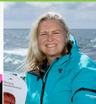
Birgitta Curtin Burren Smokehouse