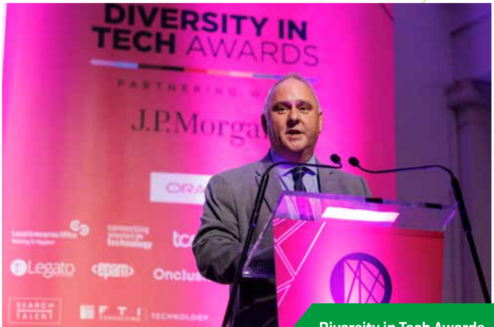
Diversity in Tech Awards

Contact Groozeze, Dogpatch Labs, CHQ Building, Custom House Quay, Dublin 1, D01 Y6H7 // www.groozeze.com // team@groozeze.com // 087 7423068