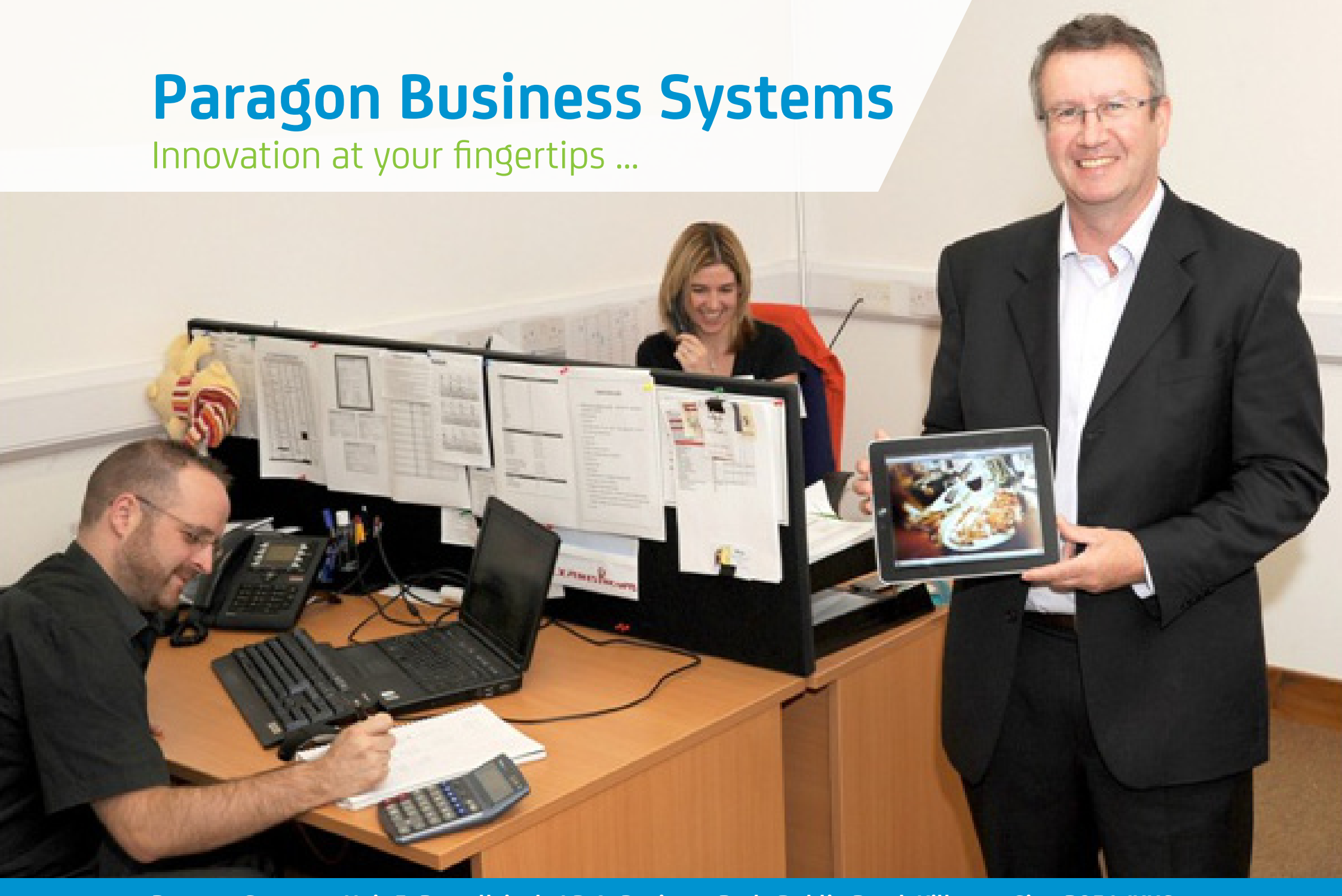
Paragon Systems, Unit 5, Purcellsinch, I.D.A. Business Park, Dublin Road, Kilkenny City, R95 WKK6

Paragon Business Systems was founded in 1994 and specialises in the provision of IT solutions to the hospitality industry, and has grown to become the leading supplier of Integrated Hotel Management Systems to the independent hotel sector, with in excess of 300 clients in Ireland.