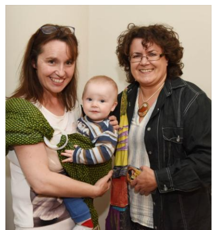
Our youngest visitor to the LEWN