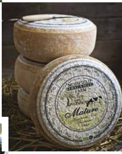
Mossfield Cheese is one of a number of produced at Mossfield Organic Farm

Great strides are also being made in celebrating and promoting filmmaking in the county. Taking place across Birr town in October, OFFline is a film festival dedicated to making and screening quality films in the Irish midlands. Last year's winner went on to win an Oscar for his film, Stutterer .