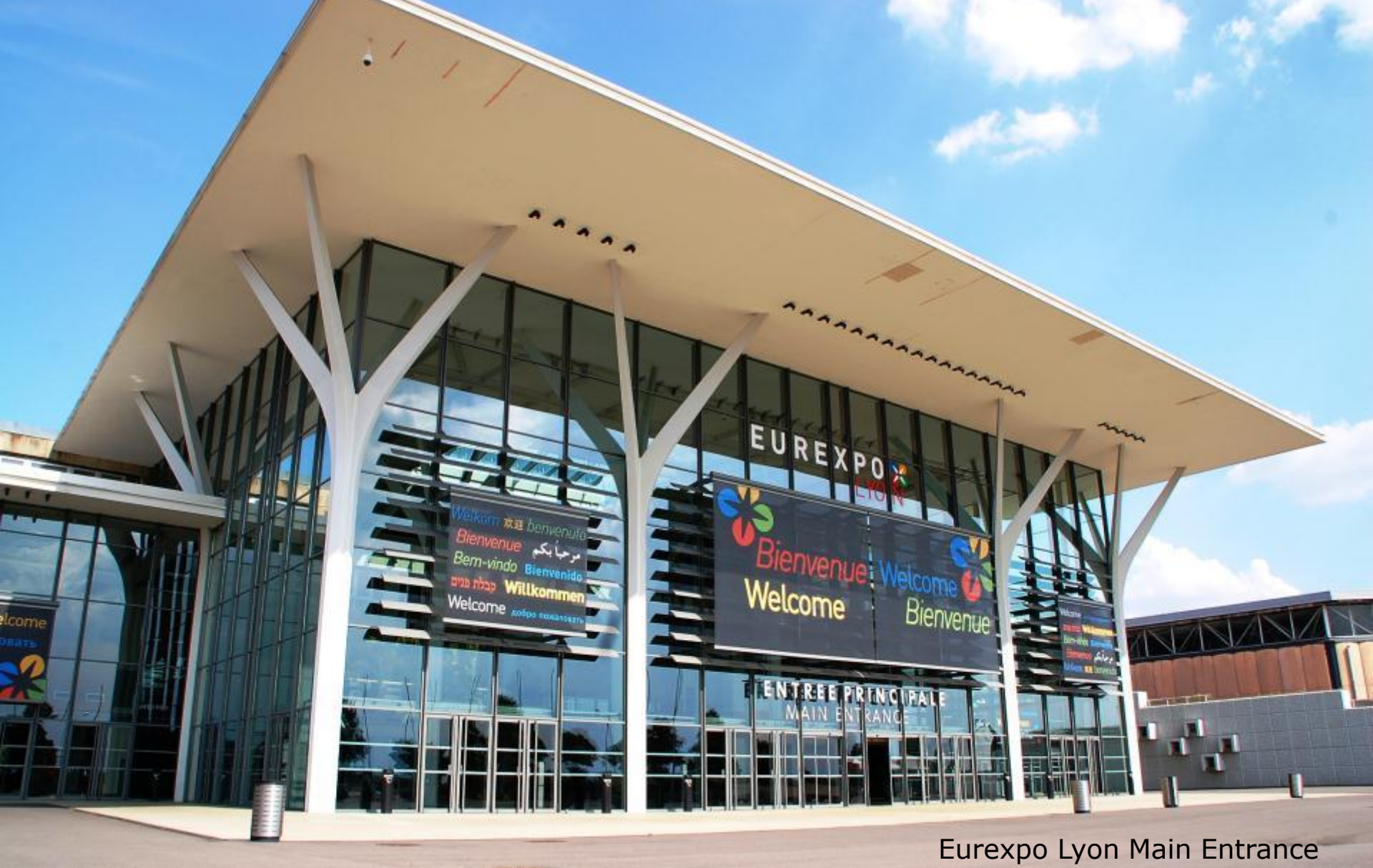
Eurexpo Lyon Main Entrance