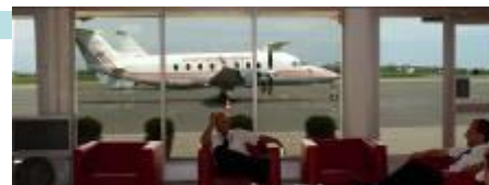
Lyon-Bron Business Airport