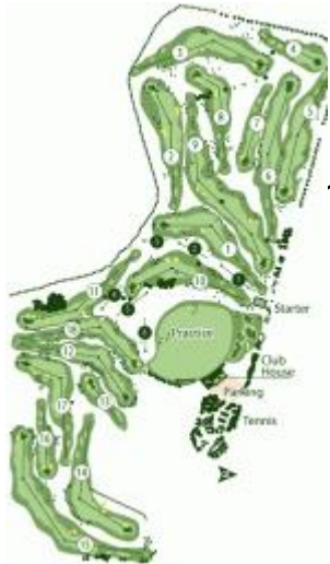
Grand Lyon Golf Course