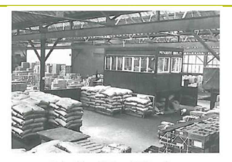
Interior of Commarket Street wholesale warehouse