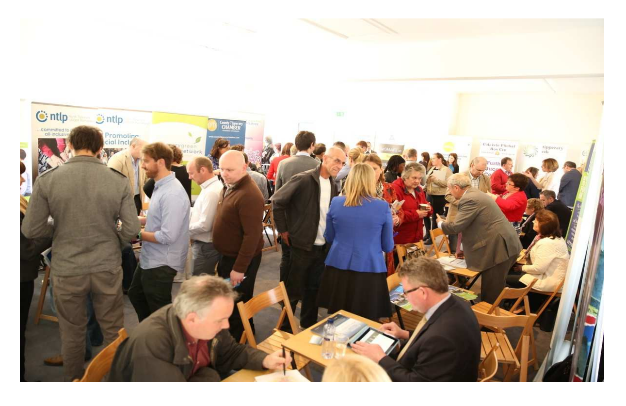
Attendees at the "Who to Talk to" Event held in Roscrea during Enterprise Week