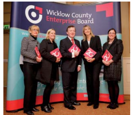
The Minister with CEO & Staff of Wicklow County Enterprise Board